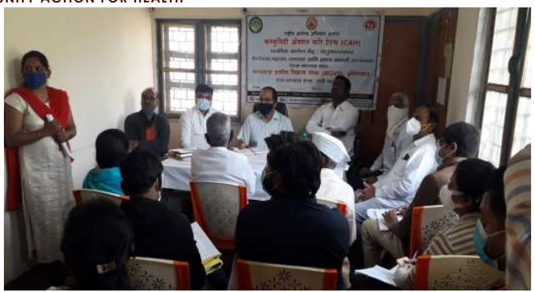
Meeting for Community Monitoring and Feedback on PHC in Aurangabd district

Community Action for health (CAH) is a monitoring and feedback intervention for government health services through the Primary Health Centres (PHC), and sub-district hospitals. CAH enables community participation for active engagement in the improvement of the health services through community assessment and monitorina mechanisms. It is a kind of social audit of the public health services which serves to facilitate active participation of peoples.