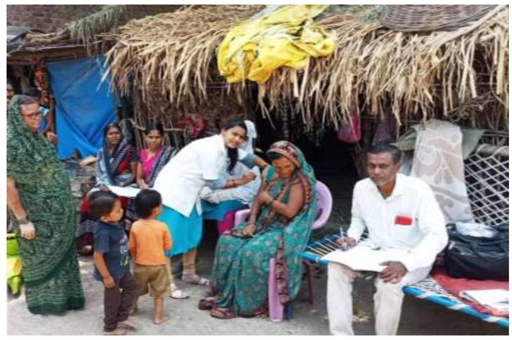
COVID Vaccination at their doorstep

The focused target groups for the project are the COVID-19 vaccine unreached populations in the selected districts. Since January 2022, with the M-RITE initiative, MGVS team has partnered with the Government and private sector to ensure increased access to vaccination particularly in the remote far-flung areas, elderly destitute persons, disabled persons, tribals, migrant workers, sex workers,