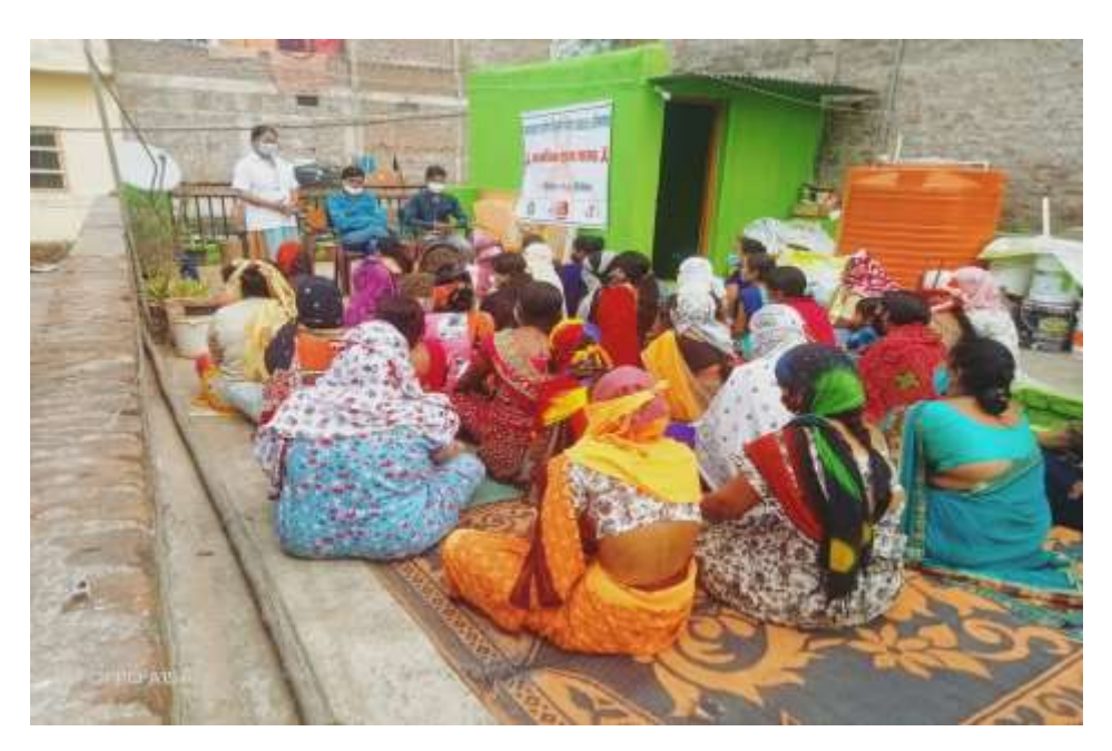
Counseling of Female Sex Workers on Safe Sex Practices

Further, the communities were also educated on ways to prevent HIV/AIDS through IEC materials, discussions, and other Behaviour Change Communication (BCC) events. The Peer Educators, trained by MGVS, are from HRGs and are constantly involved in sharing knowledge on safe sex practices with other HRG members. Presently, there are 156 Peer Educators who meet regularly for capacity building and support. These interventions have reduced the HIV prevalence rate in the district.